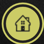
REAL ESTATE MARKETS